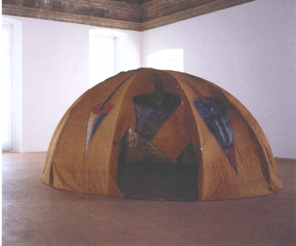
Igloo (Tenda di Gheddafi) [Igloo (Qaddafi's tent)], 1968–1981 Castello di Rivoli Museo d'Arte Contemporanea, Turin.

Associated with the arte povera movement that favored the use of “poor” materials from nature and from the waste of the consumer society, Mario Merz (Milan, 1925–2003) is a key figure for understanding the evolution of European art in the second half of the twentieth century. Merz created a conceptually rigorous oeuvre of great poetic and iconographic power that was also a radical critique of industrial and consumerist modernity. He believed that the zeal to accumulate drove human beings away from nature and into an alienated life from which consciousness of communal life had been banished, along with the possibility of establishing emotional rather than merely instrumental connections with the environment.