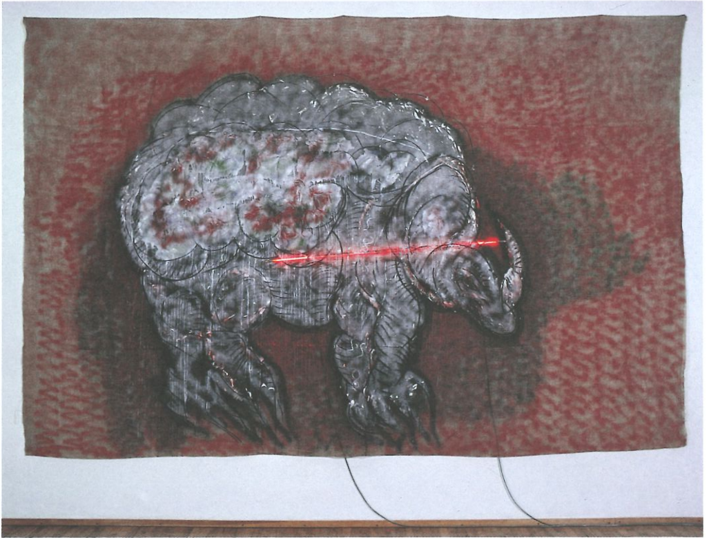
Rinoceronte [Rhinoceros], 1979. Private collection, Madrid.

MUSEO NACIONAL CENTRO DE ARTE REINA SOFIA